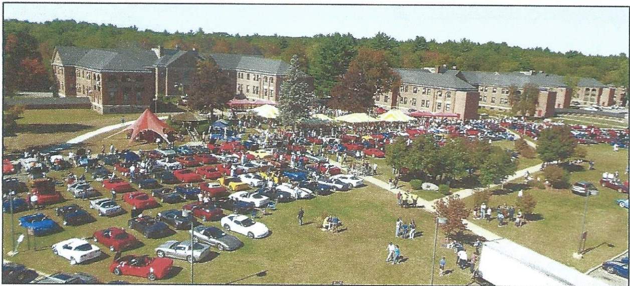
10th Annual Vettes to Vets Event 2013, Bedford Veterans Hospital

Please make checks payable to Vettes to Vets and note 'GPF 9001' in the memo section of the check.